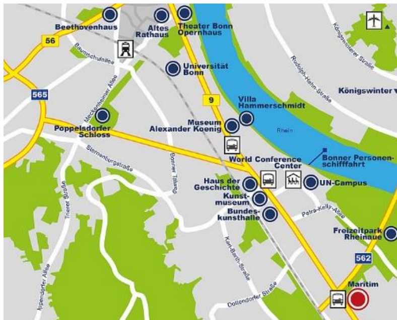
Map: Directions | Maritim Hotel Bonn

Underground parking in Maritim Hotel Bonn with 350 spaces -