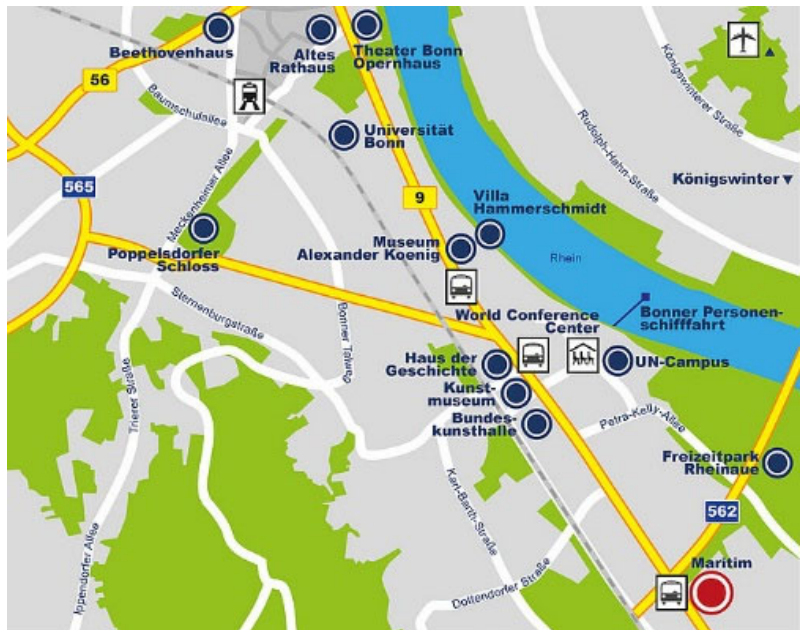
Map: !Directions | Maritim Hotel Bonn !

Underground parking in Maritim Hotel Bonn with 350 spaces -